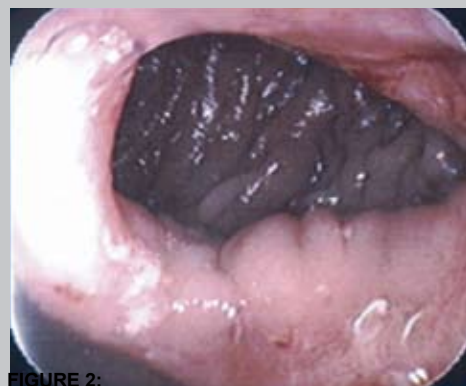
FIGURE 2: Gastrojejunostomy after endoscopic removal