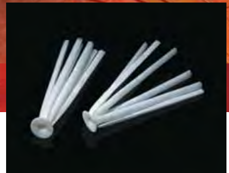
A revolutionary combination of proven material and patented design.

Insist on a great fit for anal fistula repair: GORE® BIO-A® Fistula Plug.