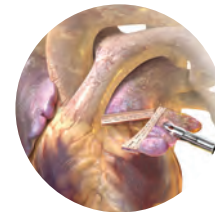
Left Atrial Appendage Ligation