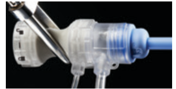
Figure 4. Clamp