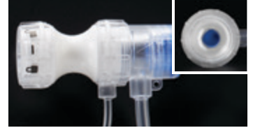
Figure 1. Valve before pressurization

In the event of valve failure (rupture of the inner film tube), clamping of the valve, twisting of the valve, or inserting the dilator will prevent blood loss. These actions are shown in Figures 4–6 .