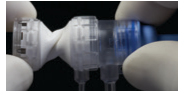
Figure 5. Twist