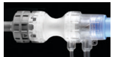
Figure 6. Lock cap