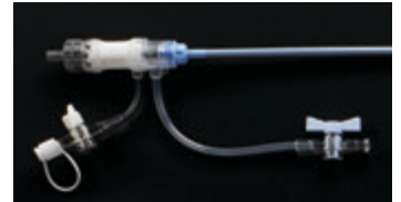
Figure 3. Pressurized with 2.5 ml saline