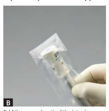
Fold the excess length of the Introducer Sleeve back onto the stapler body.