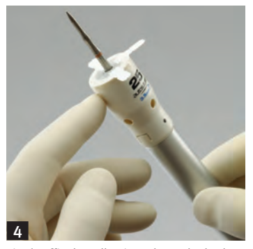
Firmly affix the adhesive tabs to the body of the stapler making certain that the device is centered and all of the staple holes are covered.