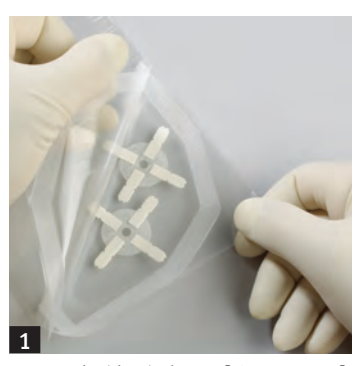
Remove the identical GORE® SEAMGUARD® Bioabsorbable Staple Line Reinforcement discs (product) from the sterile pouch.