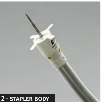
Slide the centering hole over the fully extended trocar with the adhesive backing paper facing the body of the stapler.