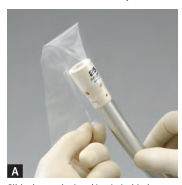
Slide the stapler head loaded with the product into the Introducer Sleeve leaving 3 inches exposed.