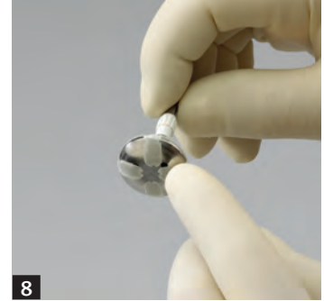
Firmly affix the adhesive tabs to the anvil making certain that the device is centered and all of the staple divots