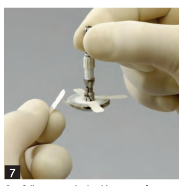
Carefully remove the backing paper from the adhesive tabs. Discard the four individual backing papers.