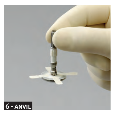
Slide the centering hole over the post of the anvil with the adhesive backing paper facing the anvil.