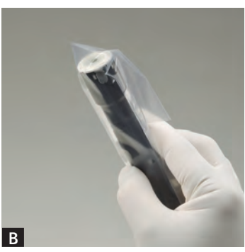
Fold the excess length of the Introducer Sleeve back onto the stapler body.