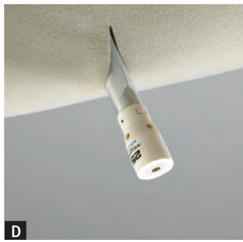
Pull back on the exposed portion of the Introducer Sleeve from the base of the stapler body exposing the head of the stapler. Ensure that the Introducer Sleeve is not covering the stapler head before proceeding to attach the anvil and complete the anastomosis.