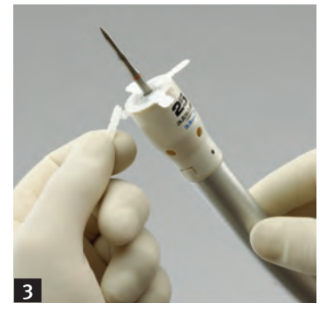
Carefully remove the backing paper from the adhesive tabs. Discard the backing