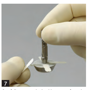
Carefully remove the backing paper from the adhesive tabs. Discard the four individual backing papers.