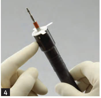
Firmly affix the adhesive tabs to the body of the stapler making certain that the device is centered and all of the staple holes are covered.