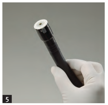
Retract the trocar.