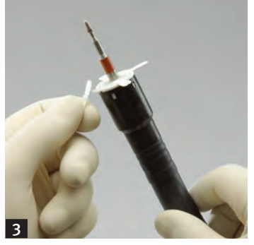
Carefully remove the backing paper from the adhesive tabs. Discard the backing papers.