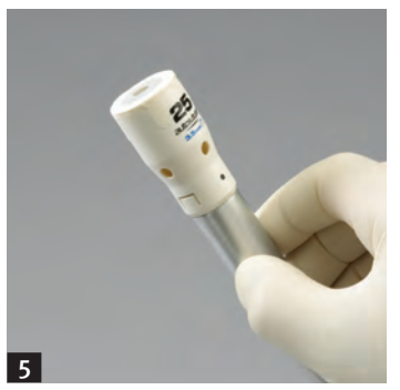
Retract the trocar.