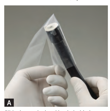
Slide the stapler head loaded with the product into the Introducer Sleeve leaving 3 inches exposed.