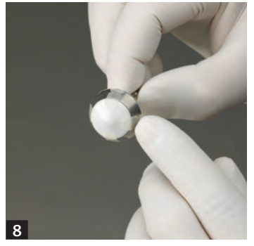
Firmly affix the adhesive tabs to the anvil making certain that the device is centered and all of the staple divots are covered.