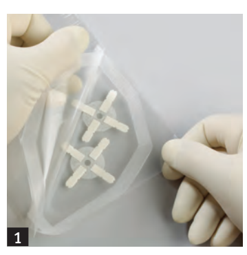
Remove the identical GORE® SEAMGUARD® Bioabsorbable Staple Line Reinforcement discs (product) from the sterile pouch.