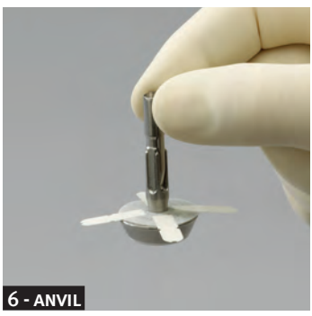
Slide the centering hole over the post of the anvil with the adhesive backing paper facing the anvil.