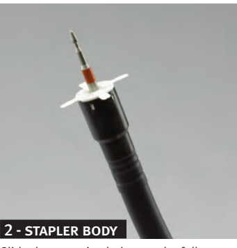
Slide the centering hole over the fully extended trocar with the adhesive backing paper facing the body of the stapler.