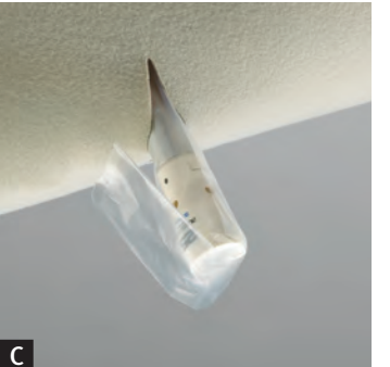
Insert the stapler body through the skin incision. Carefully advance the stapler until the folded portion