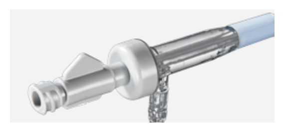
The GORE® TIPS Sheath consists of a flexible 10 Fr introducer sheath with a hemostatic valve and a 10 Fr dilator.