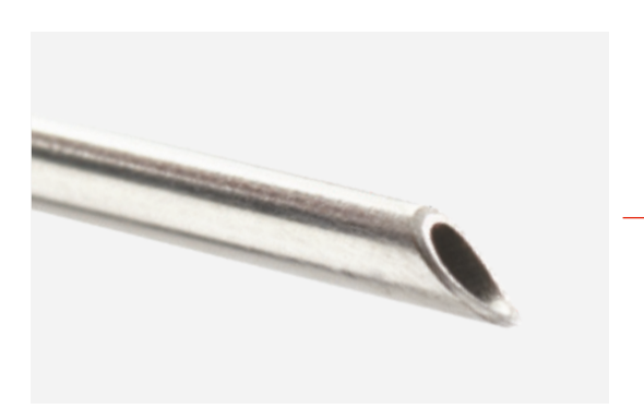
Sharp needle tip aids precise needle puncture.