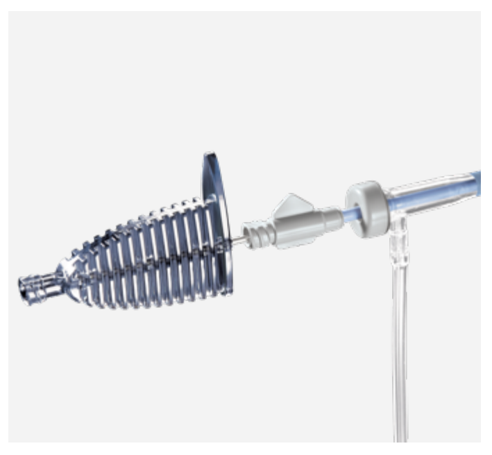
The GORE TIPS Set consists of the GORE® TIPS Sheath and the GORE TIPS Needle.