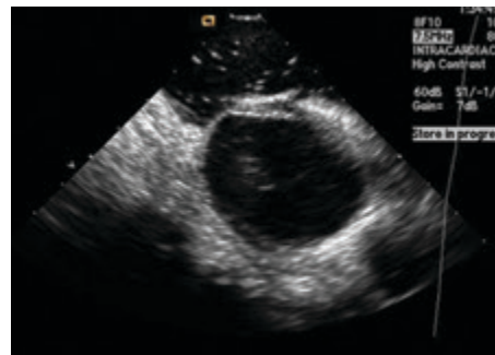
Image B: Closure of PFO with 30mm GORE® CARDIOFORM Septal Occluder.