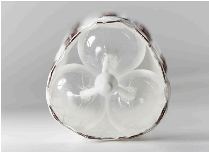
Large Balloon Catheter in GORE® TAG® Thoracic Endoprosthesis