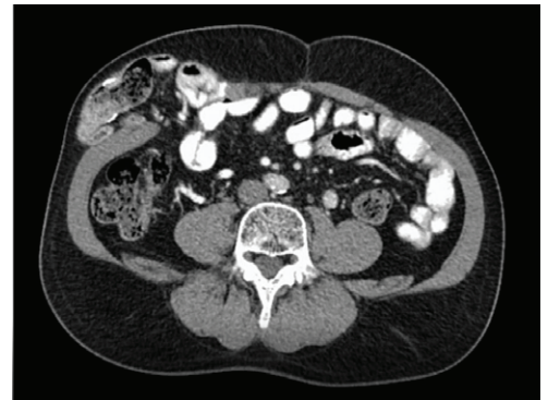
Patient initial pre-op CT scan showing significant hernia

Click here or on images for virtual case review »